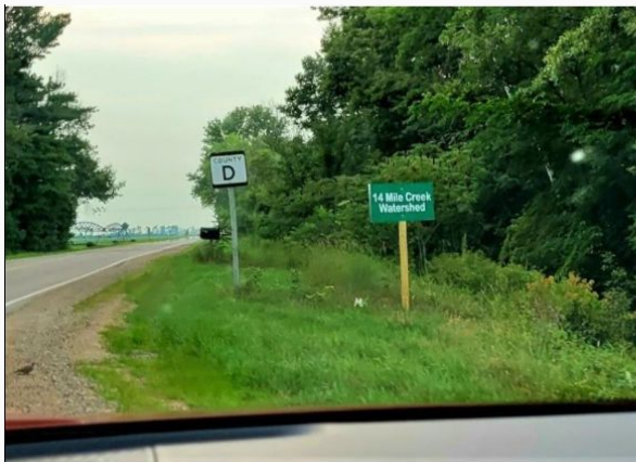
14 Mile Creek Watershed sign at Adams CTH D and state highway 73.